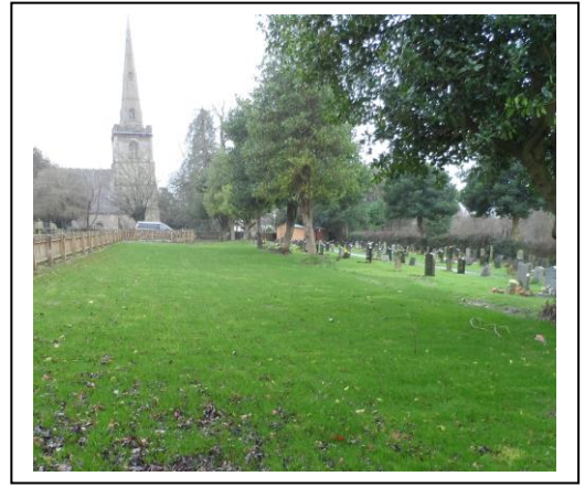
New Burial Ground

More information about the burial ground and application forms for burials and monuments are available from our website